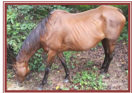
The photo of the mare was taken prior to arrival at HPS. Notice the large worm belly.

Thoroughbreds are wonderful large long-necked creatures and that makes it difficult to read their tattoos, if they have one. We tried but she's too tall to get a good view and we were not willing to upset this pretty girl. We have a black light coming and this will help to be able to read the tattoo, if there is one.