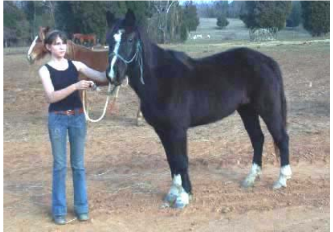
Blackberry is looking for that special Angel Sponsor